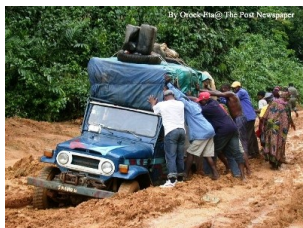
Roads are the most challenging during the rainy season